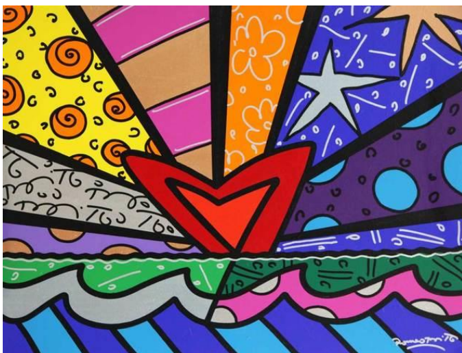
New Love, 2016