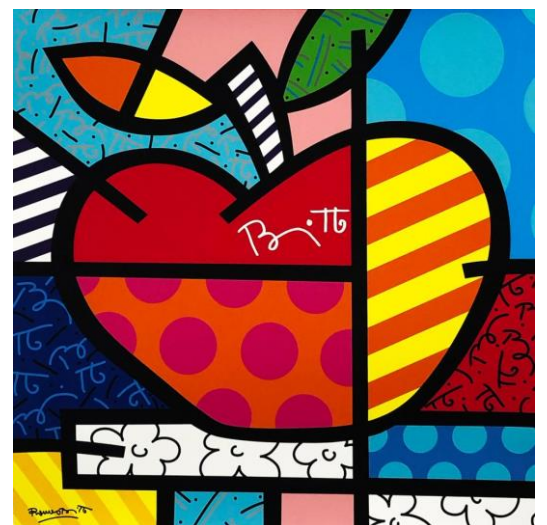
True Apple, 2017