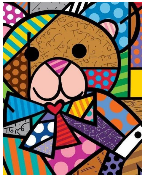
Hug Bear 2020